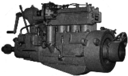
Man 24/26 110 Drehmoment Drehmoment, 1800/min Drehmoment \frac{1}{2} im Drehmoment \frac{1}{2} im Drehmoment.