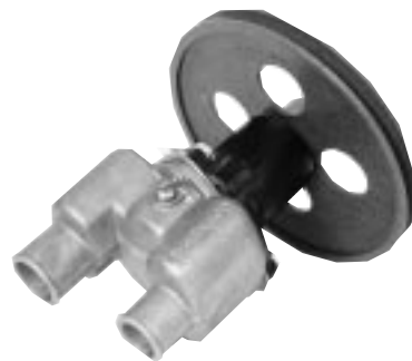
G9901 & G9903