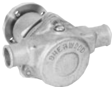
K75 & K75B