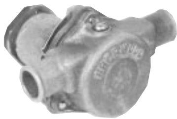
G30-2 & G30-2B